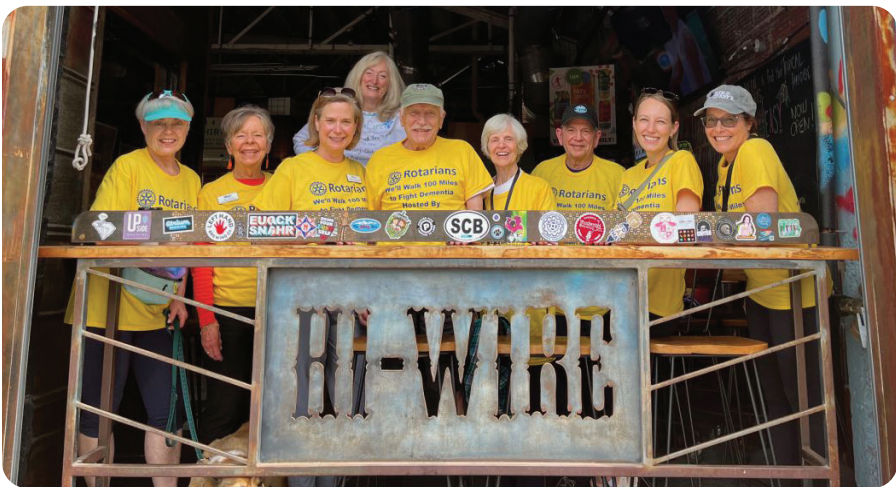
The Rotary Club of Asheville – Biltmore hosted the 100 – mile walk with the Brewers of Asheville benefitting MemoryCare and CART, which provided $43,000 of support to MemoryCare.